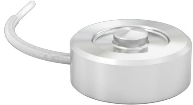
Model LBM-5K (Shown)