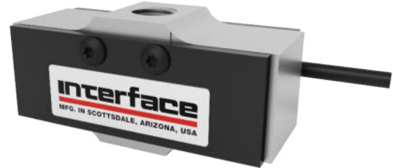
Model SML-200 (Shown)