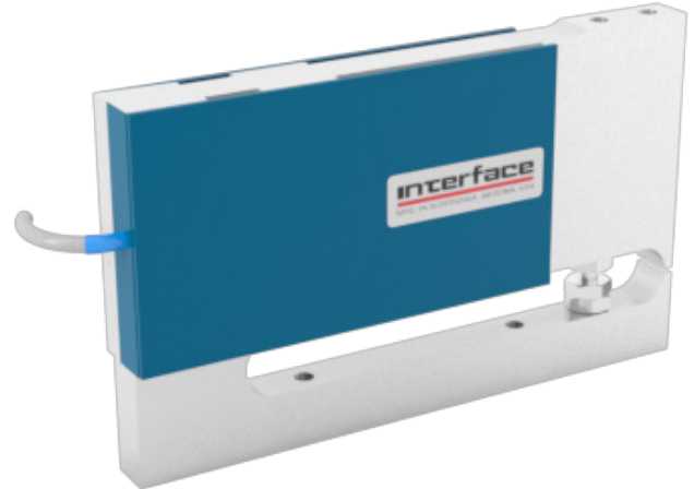
Model SPI (Shown)