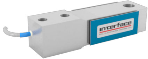
Model SSB-500 (Shown)