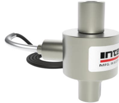
Model WMCFP (Shown)