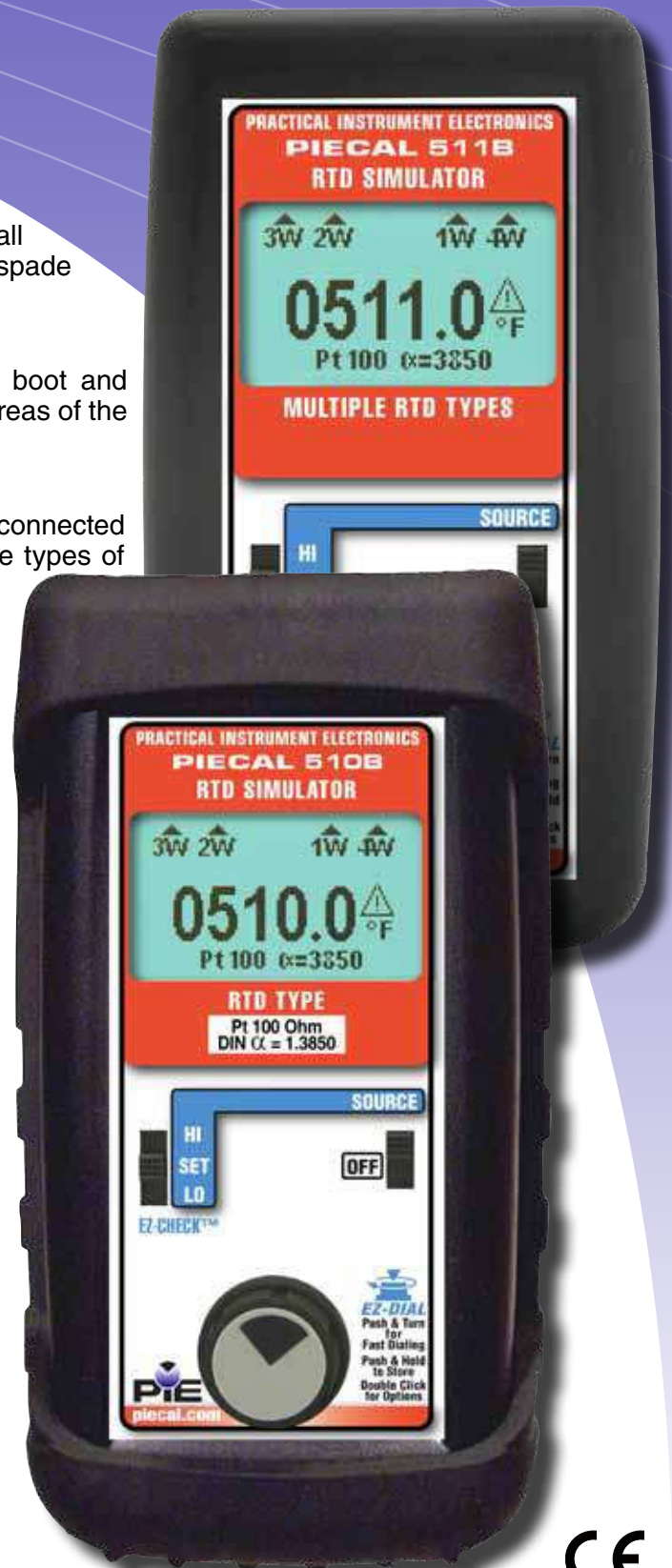
Actual Size (Shown with optional boot)

* PIECAL Calibrators are not manufactured or distributed by Fluke Corp or Altek Industries Inc, manufacturers of Altek Calibrators.