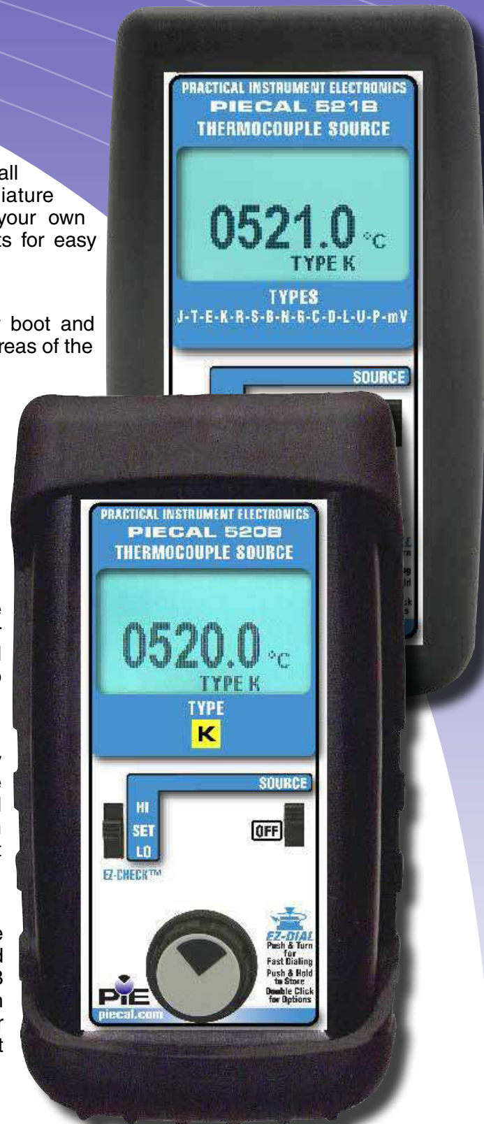
Actual Size (Shown with optional boot)