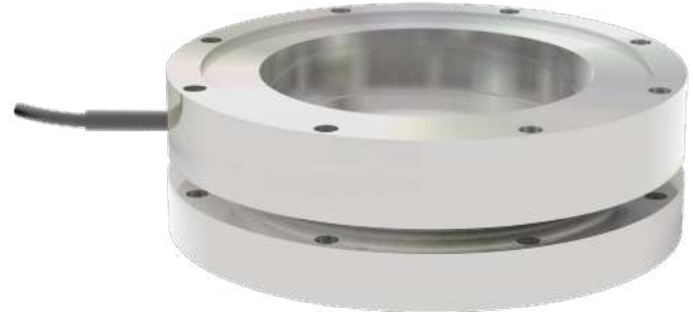
Model LWPF1 (Shown)