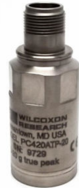
Table 1: PC420ATP-yy model selection guide

Wilcoxon's PC420ATP series sensors provide 24/7 output of true peak acceleration, allowing for continuous trending of overall machine vibration in process control systems. True peak output is particularly useful in detecting loose parts on reciprocating machinery. The trend data alerts users to changing machine conditions and helps guide maintenance in prioritizing the need for service.