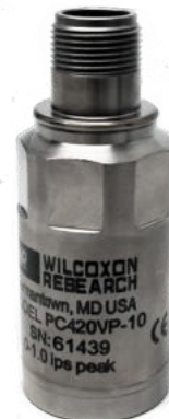
Table 1: PC420Vx-yy model selection guide

Wilcoxon's PC420V series sensors provide a 4-20 mA output proportional to velocity vibration, allowing for continuous trending of overall machine vibration. This trend data alerts users to changing machine conditions and helps guide maintenance in prioritizing the need for service. The choice of RMS or peak output allows you to choose the sensor that best fits your requirements.