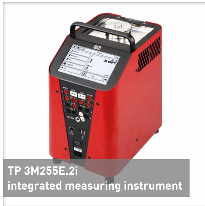
TP 3M255E.2i integrated measuring instrument