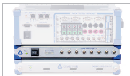
Connection box to power eight current transducers [DW2-CLAMP-DC-POWER-8]