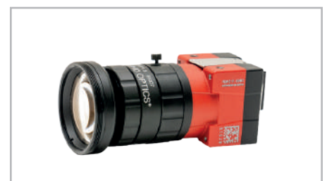
Industrial USB 3.0 cameras for video input [CAM-ALVIUM-1800-U-x]