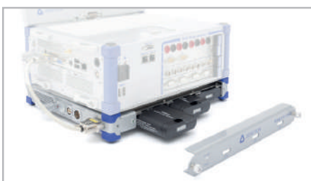
External battery pack: 250 W UPS with 3 battery slots [DW2-UPS-250-DC]