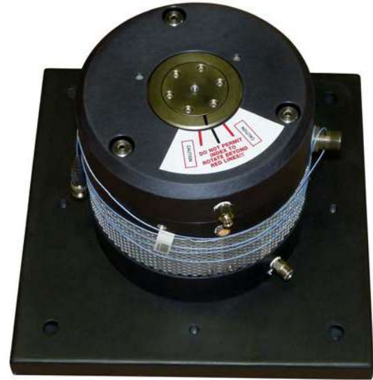
High-Frequency Air Bearing Calibration Vibration Exciter Model CAL25HF