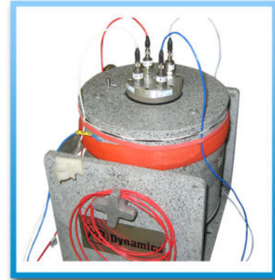
"4-in-1" MDAC mounted with four (4) PE accelerometers

The highly versatile "4-in-1" multi device under test (multi-DUT) automated accelerometer calibration system (MDAC) from MB Dynamics can simultaneously, efficiently, and accurately perform calibrations of up to four piezoelectric (charge or PE), IEPE (low-impedance voltage mode), or variable capacitive (VC) accelerometers (DUT's) of the same model and type, each weighing up to 20 grams, over frequencies from 1 Hz to 4000 Hz. The "4-in-1" MDAC can additionally perform automated single-DUT calibrations of PE, IEPE, velocity, piezoresistive and VC accelerometers, as well as vibration sensors and transducers, over frequencies from 1 Hz to 10 kHz, utilizing the MB Dynamics CAL50 calibration vibration exciter.