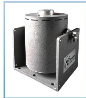
CAL50 Calibration Vibration Exciter