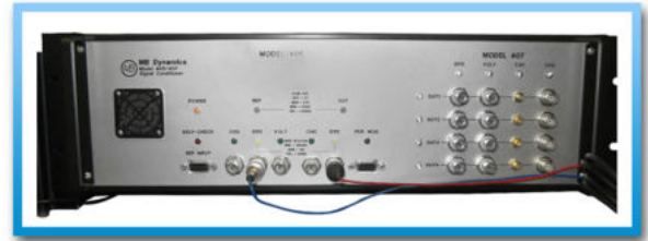
Model 405/407 Multi-Channel Signal Conditioner