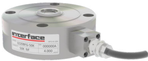
Model 3220BFG-50K (Shown)