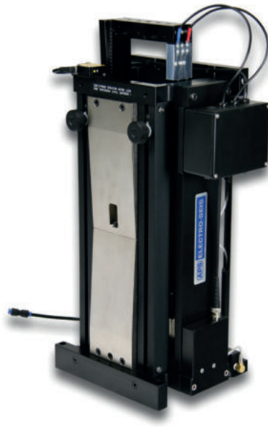
APS 113-AB with APS 0162 vertical mounting kit

APS 0162 - VERTICAL MOUNTING KIT - permits vertical orientation of the shaker, either free-standing or rigid bench attachment.